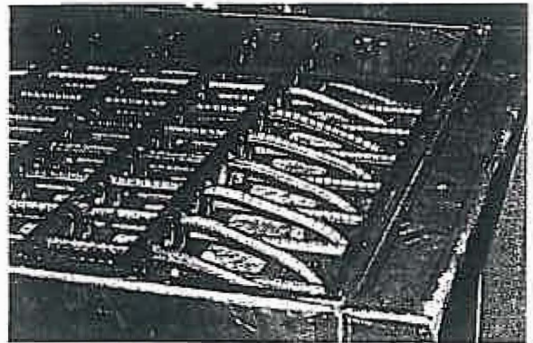
An impressive steel grid forms just one of the many lines of defense in the body build-up completely shrouding the main dense monolithic core of aluminum corund casting.

MANUFACTURED IN SWEDEN BY THE JOHN TANN SECURITY GROUP.