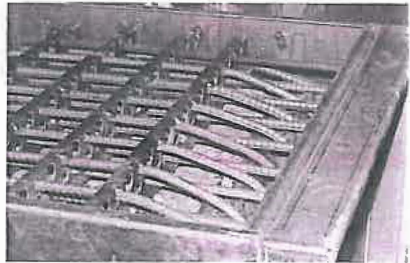
An impressive steel grid forms just one of the many lines of defense in the body build-up completely shrouding the main dense monolithic core of aluminum corund casting.

The INTERSEC Nordic Series is beautifully finished in a textured sand-grey with steel-blue fascia and polished chrome fittings.