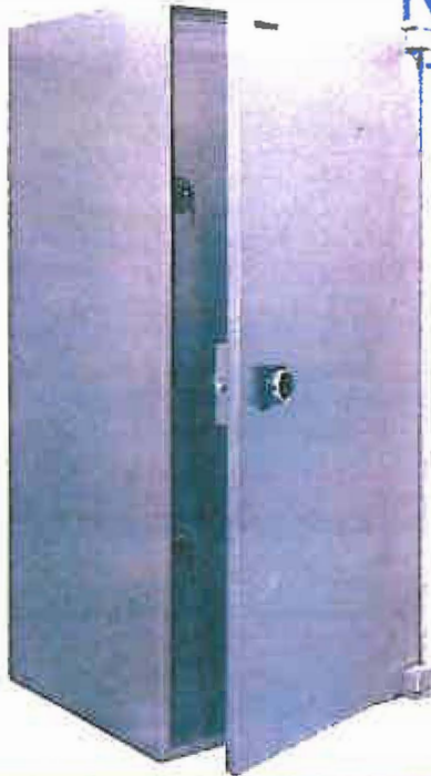
TL-15 and TL-30 MONEY SAFES

These Chubb Safes are listed by Underwriters Laboratories (U.L.) and carry either the TL-15 (15 Minute Attack Protection) or the TL-30 (30 Minute Attack Protection) label.