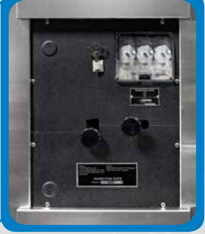
Emergency release built into door